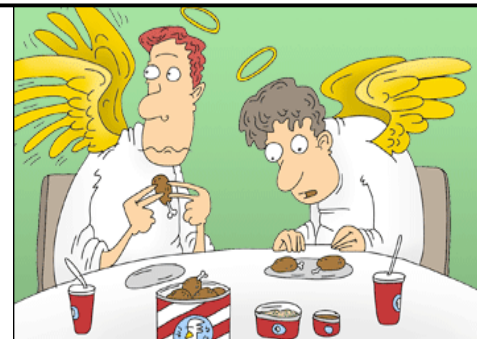
06-21-2011 WEIRD ... I USED TO LOVE WINGS BACK ON EARTH