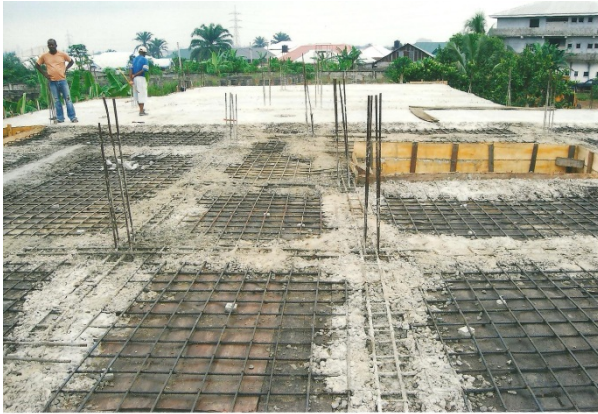
Teachers Accommodation- Floor for upstairs The school in the distance