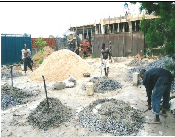
Mixing the cement