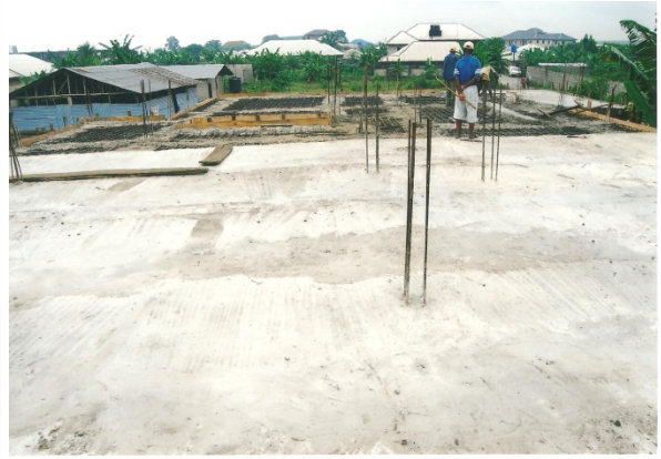
Putting down the iron rods for strength The surrounding area is now being developed