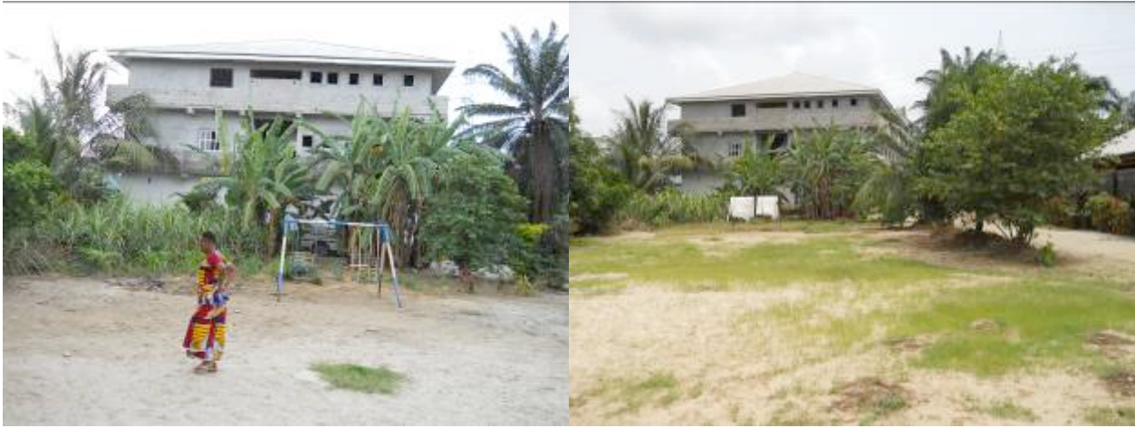
Roofing the School was a major step forward as it is now watertight. Playground in front