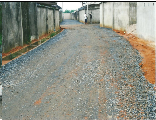
New access road