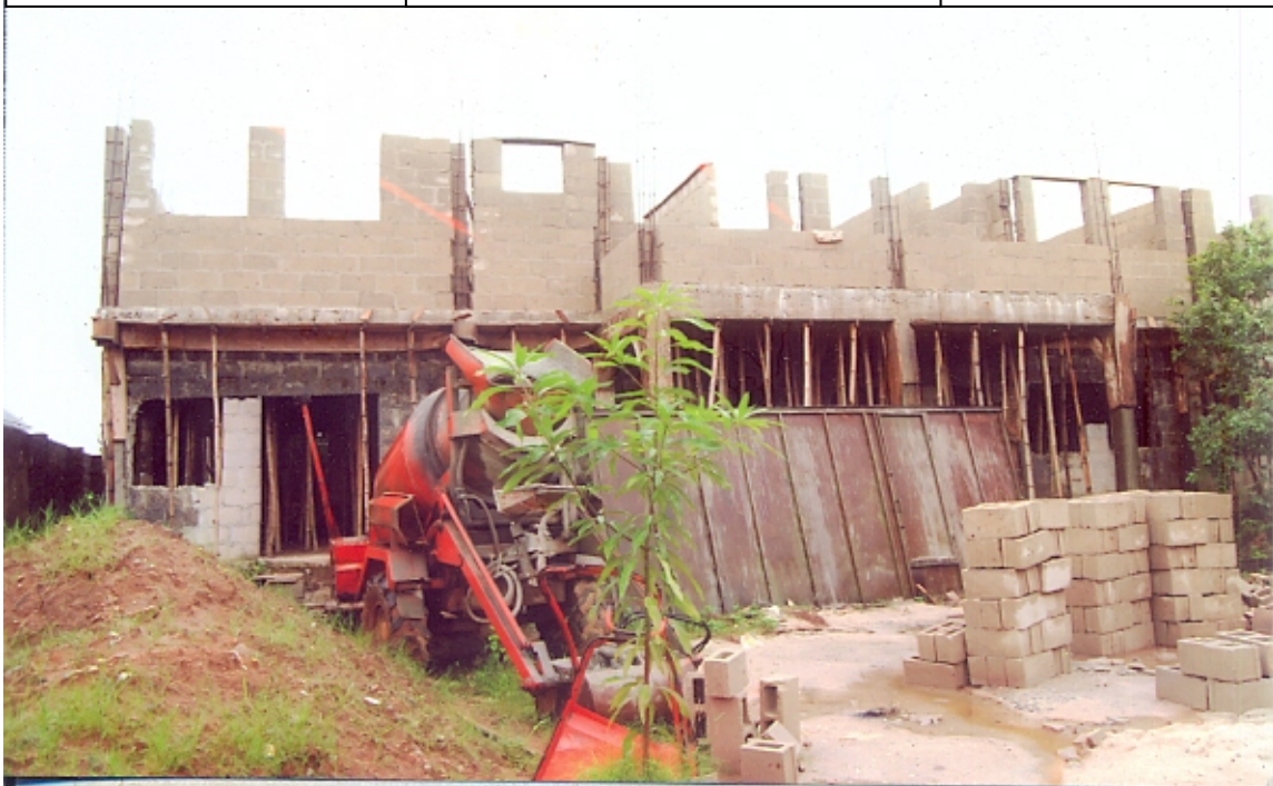
The first floor of the teachers' accommodation takes shape