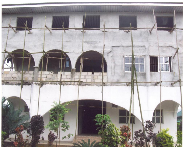
The school frontage