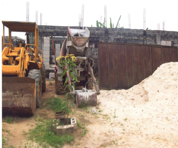
WORK IN PROGRESS TEACHERS ACCOM