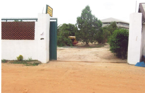
The school entrance