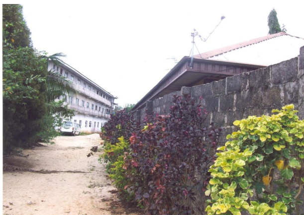
The school drive, school bus, main building